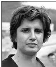
Maria Teresa de Filippis